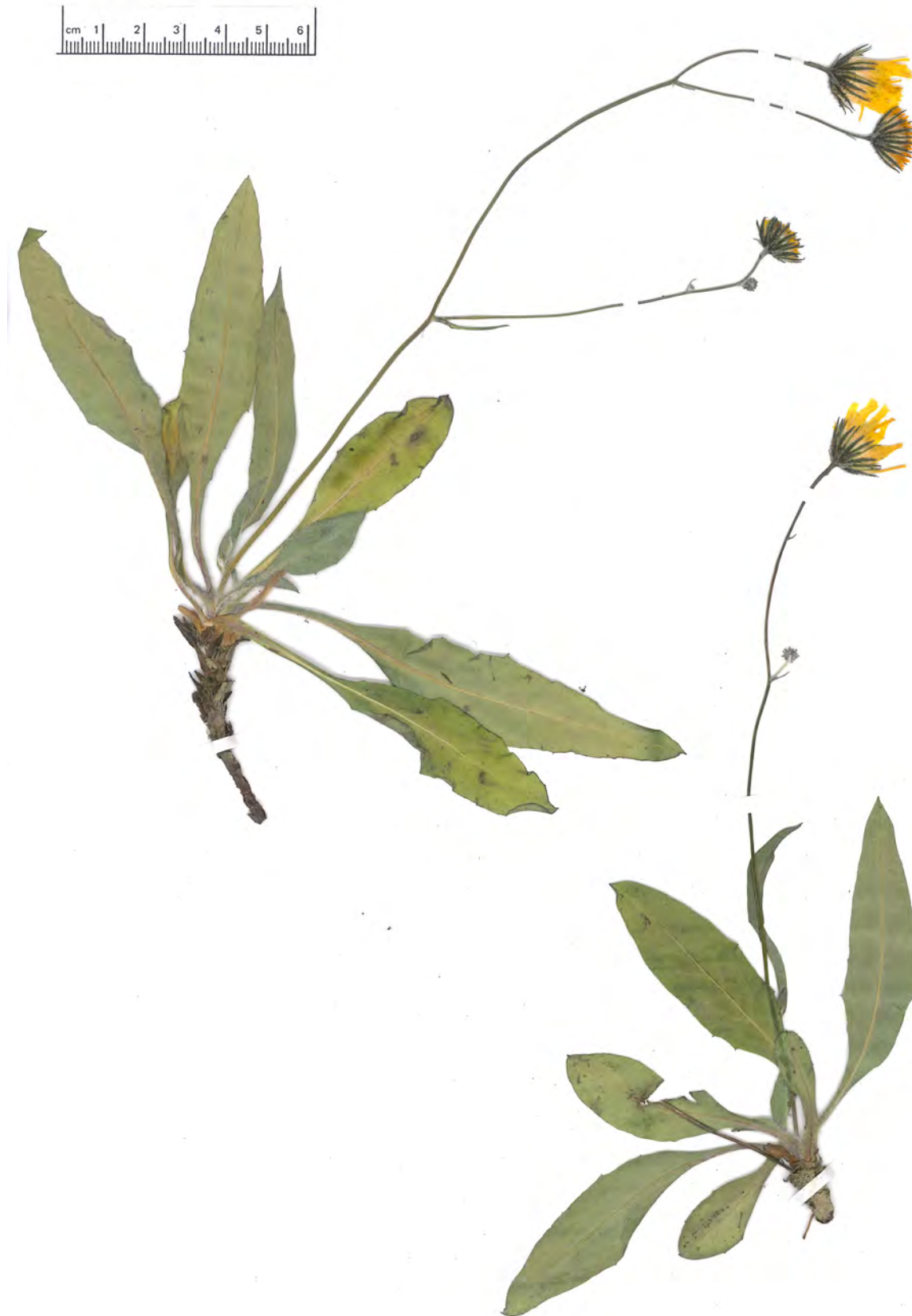
Fig. 1: Hieracium gramosicum GOTTSCHL. & DUNKEL, habitus.