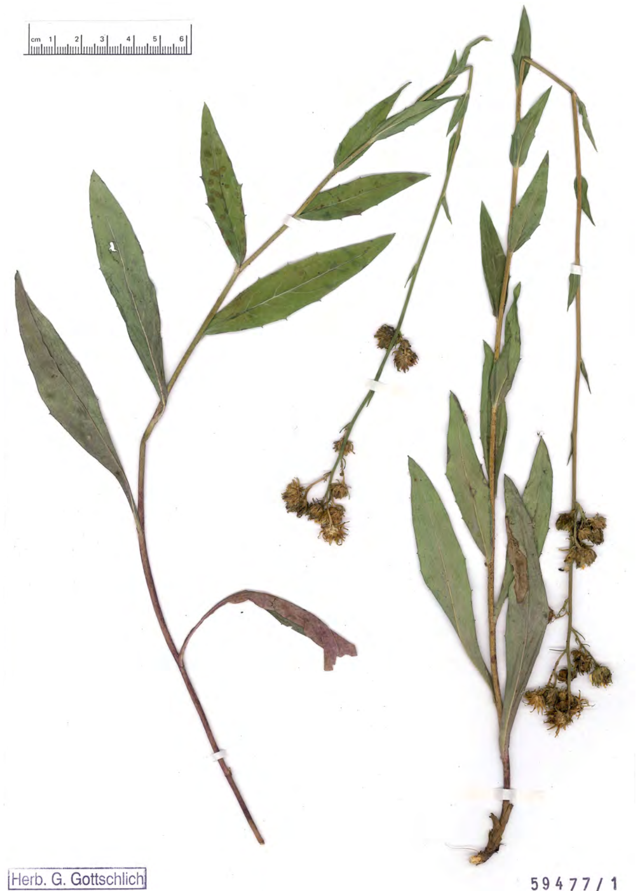
Fig. 6: Hieracium xanthicum GOTTSCHL. & DUNKEL, habitus.