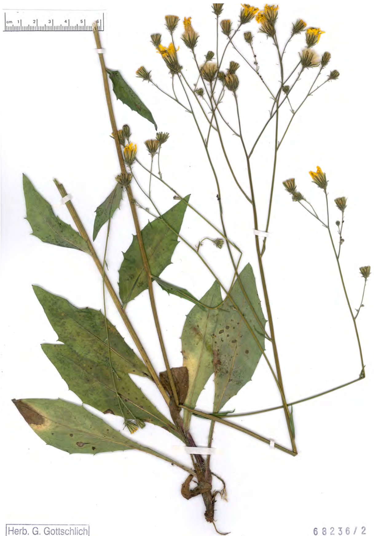
Fig. 8: Hieracium camkorijense subsp. boreograecum GOTTSCHL. & DUNKEL, habitus.