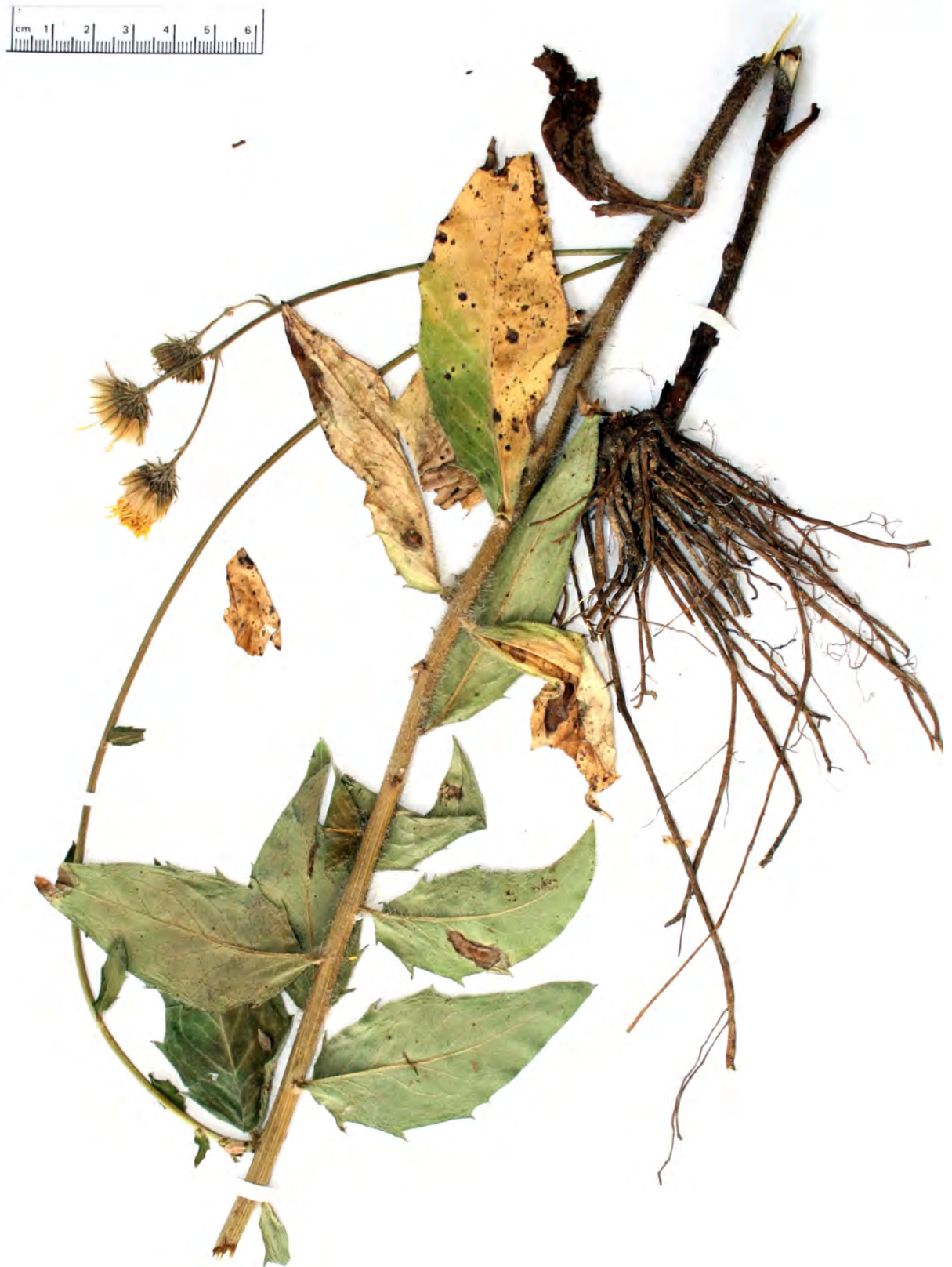
Fig. 4c: Hieracium sabaudolypticum GOTTSCHL. & DUNKEL, lower part of the stem.