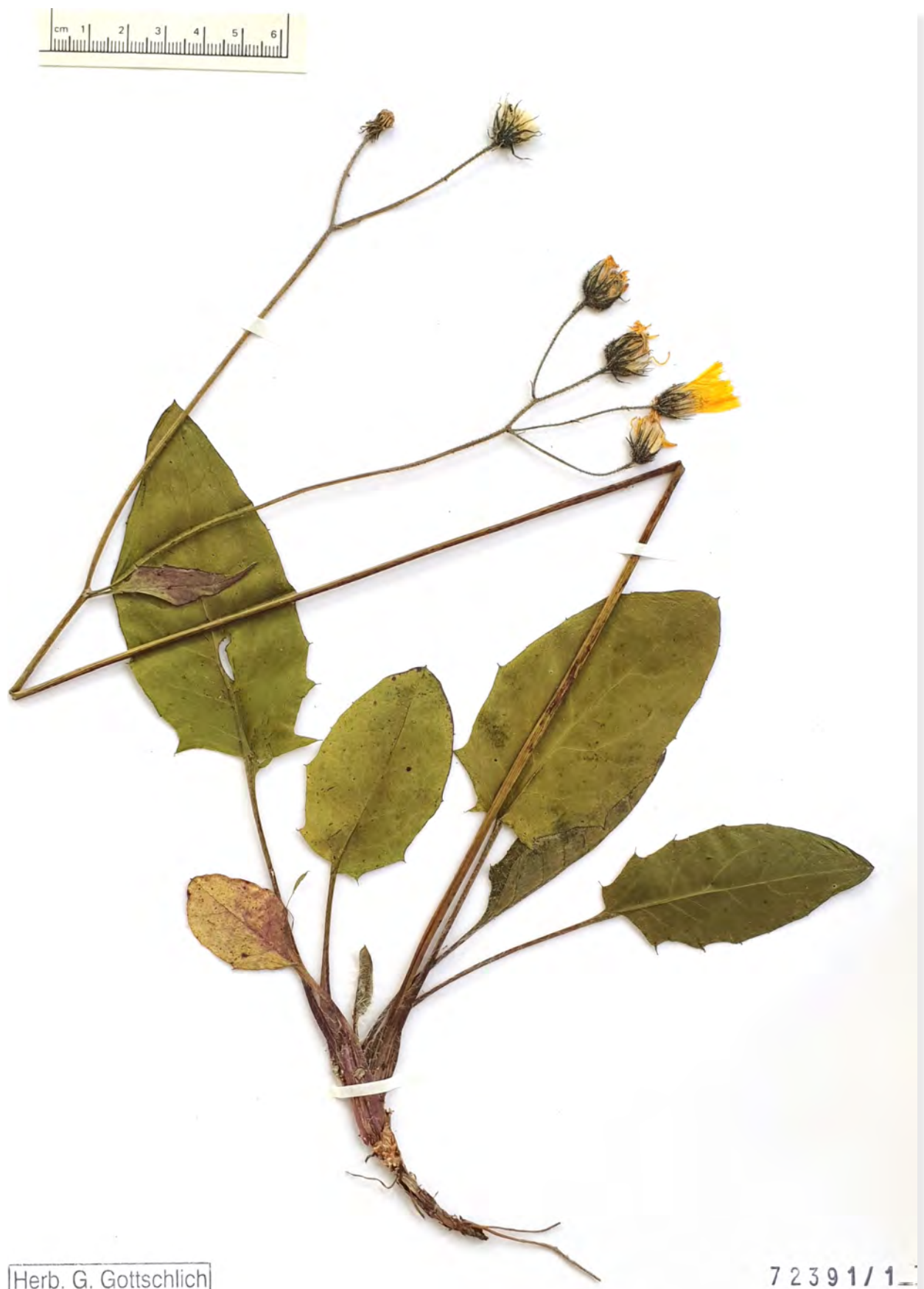
Fig. 13: Hieracium hypochoeroides subsp. paikoanum GOTTSCHL. & DUNKEL, specimen.