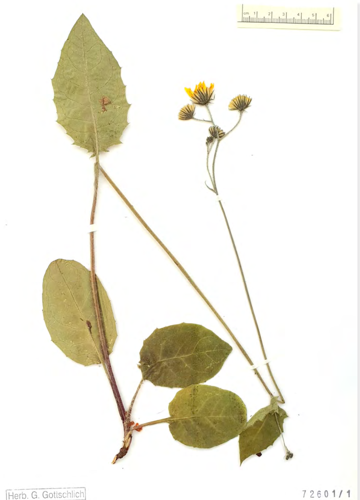
Fig. 2: Hieracium abietopsis GOTTSCHL. & DUNKEL, specimen.