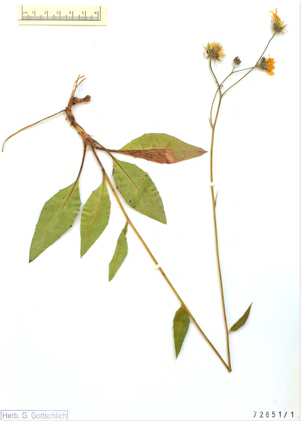
Fig. 3: Hieracium caesiolympicum GOTTSCHL. & DUNKEL, specimen.