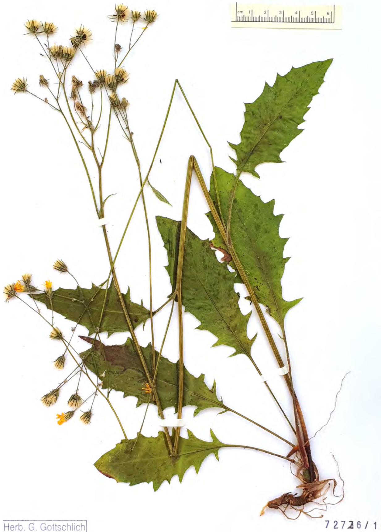
Fig. 8: Hieracium perdentatum GOTTSCHL. & DUNKEL, specimen.