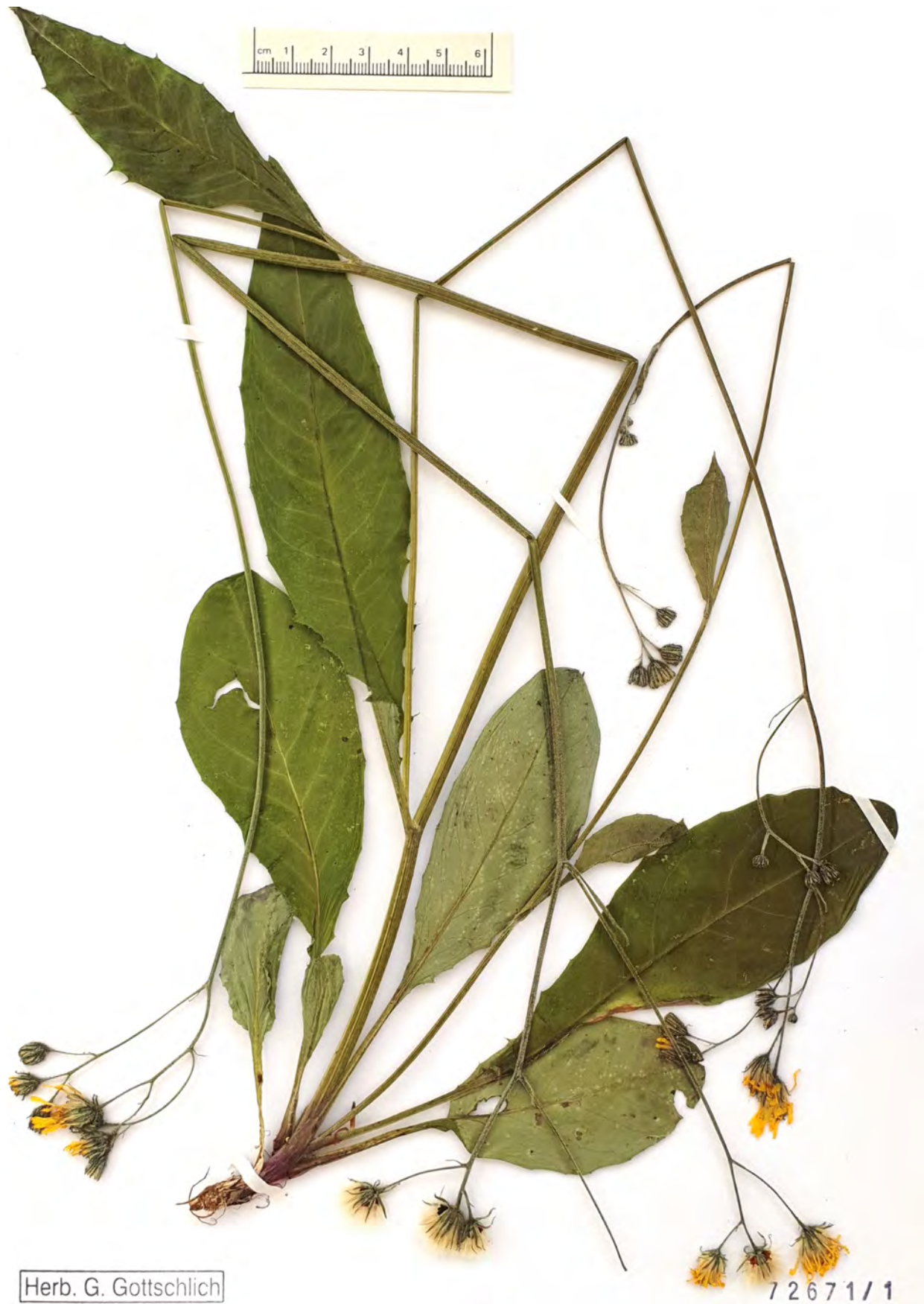
Fig. 15: Hieracium retyezatense subsp. macilentoides GOTTSCHL. & DUNKEL, specimen.