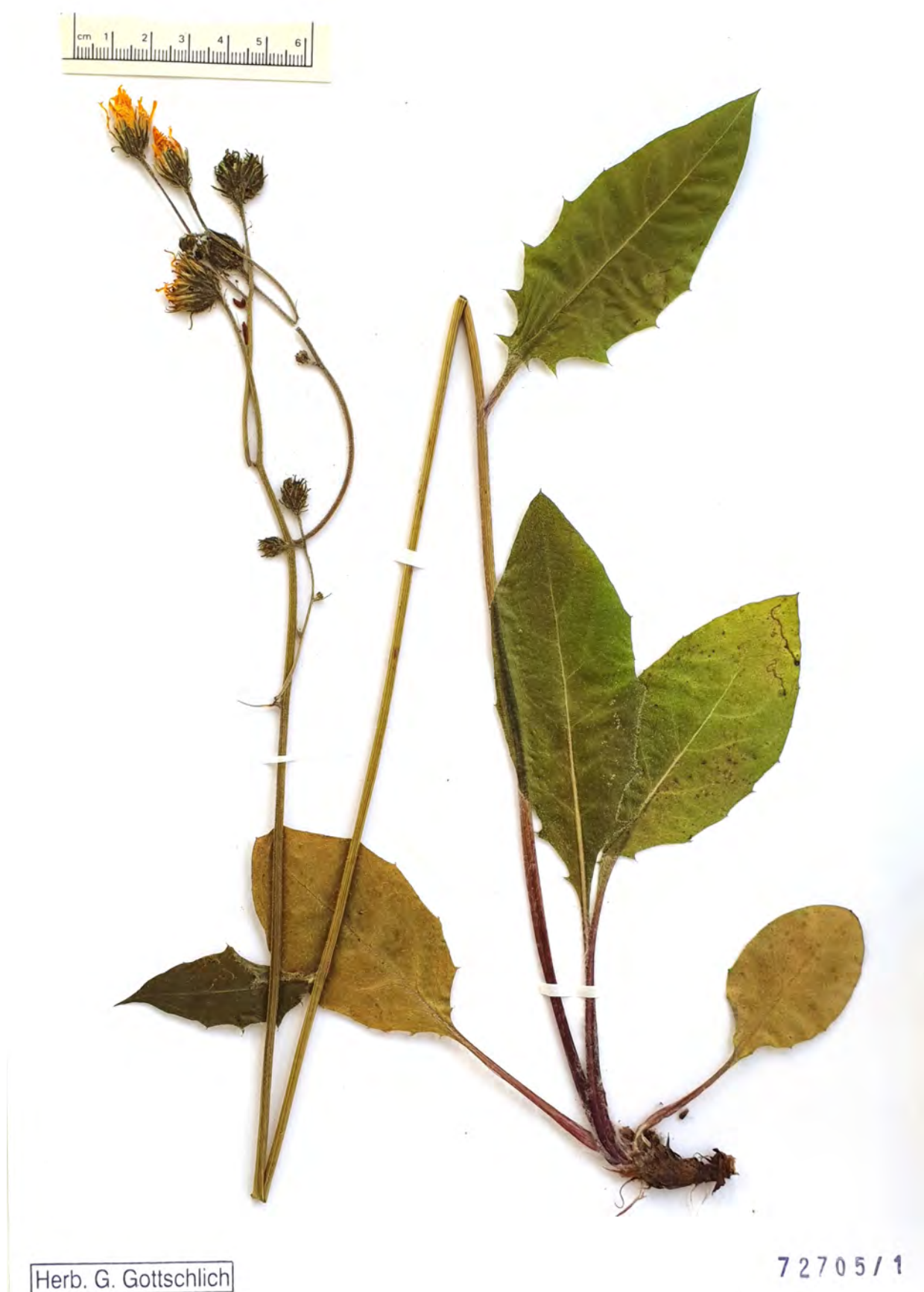
Fig. 5: Hieracium diaphanoidopsis GOTTSCHL. & DUNKEL, specimen.