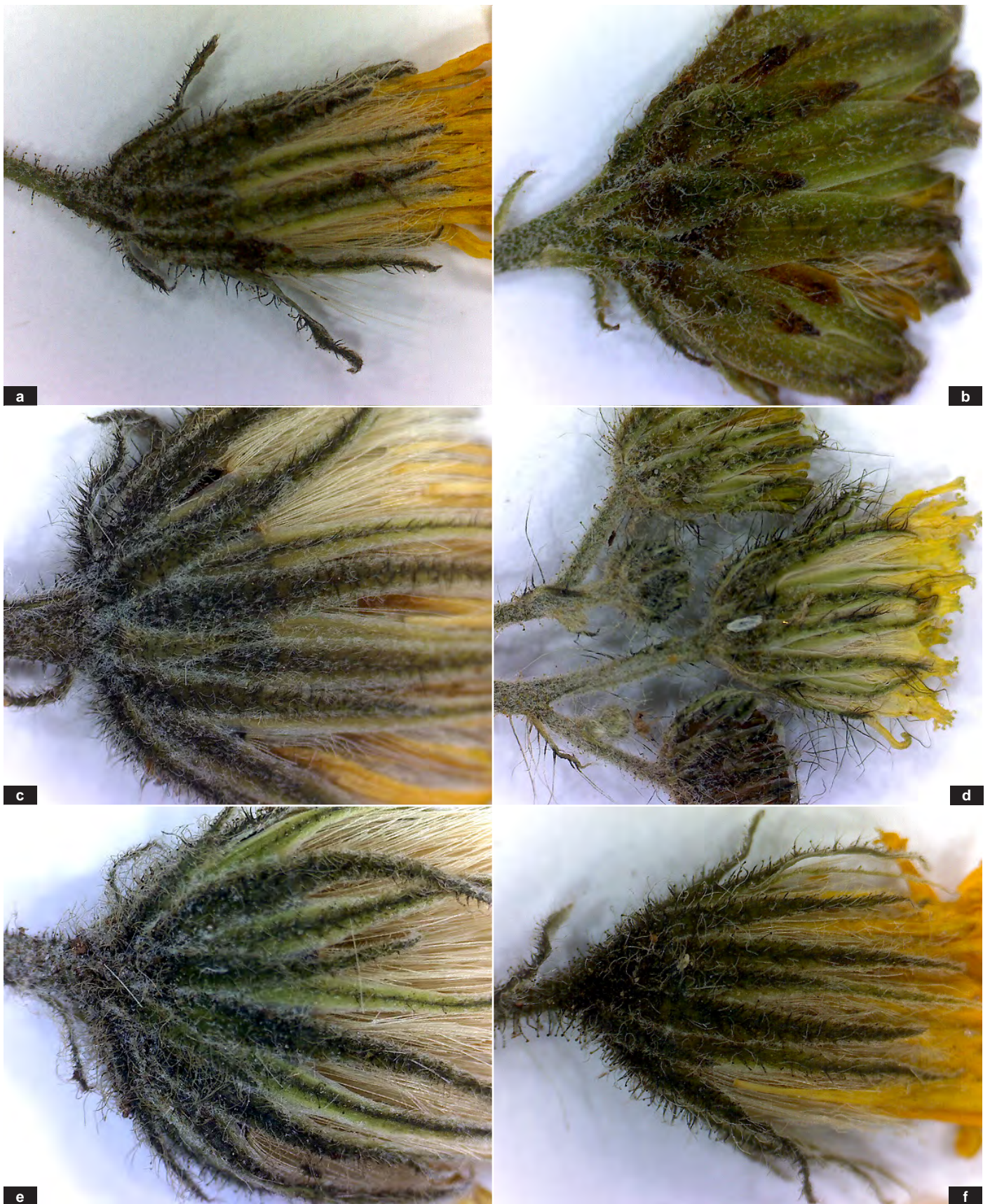
Fig. 19: capitula: a: H. perdentatum , b: H. thessalonikense , c: H. vermiense , d: P. pieriana , e: H. diaphanoidopsis subsp. volakansense , f: H. hypochoeroides subsp. paikoanum .