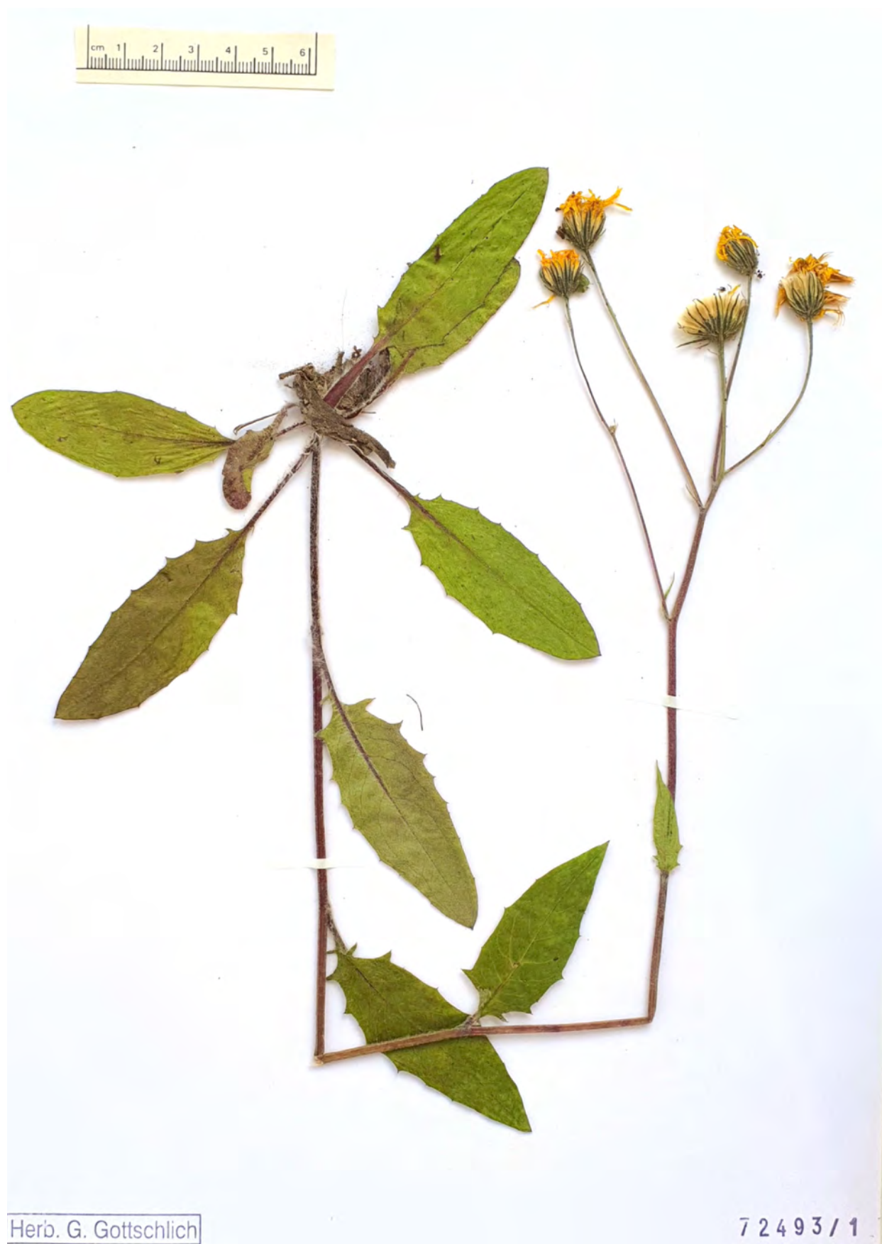
Fig. 12: Hieracium diaphanoidopsis subsp. volakasense GOTTSCHL. & DUNKEL, specimen.