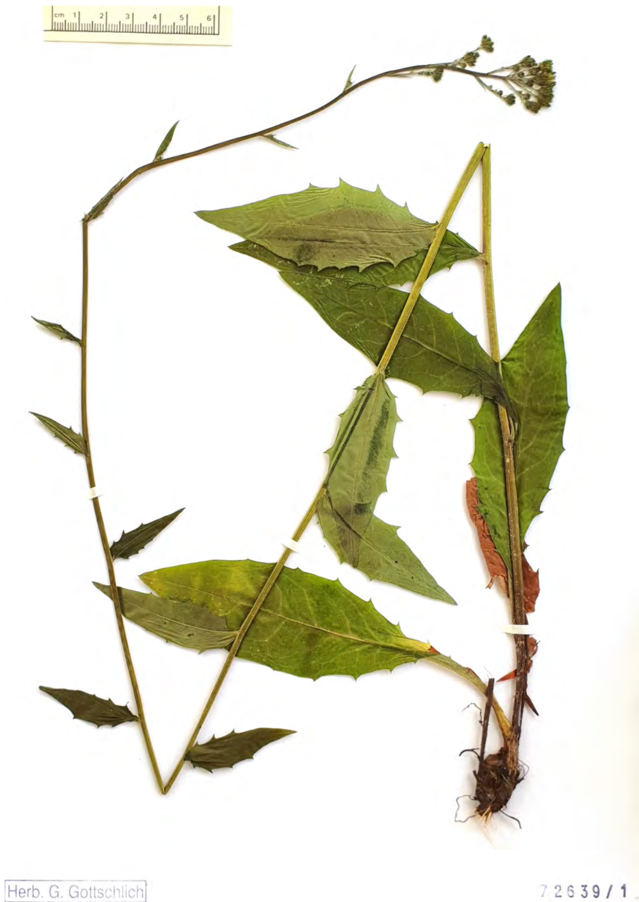
Fig. 14: Hieracium pseudosparsum subsp. elatianum GOTTSCHL. & DUNKEL, specimen.