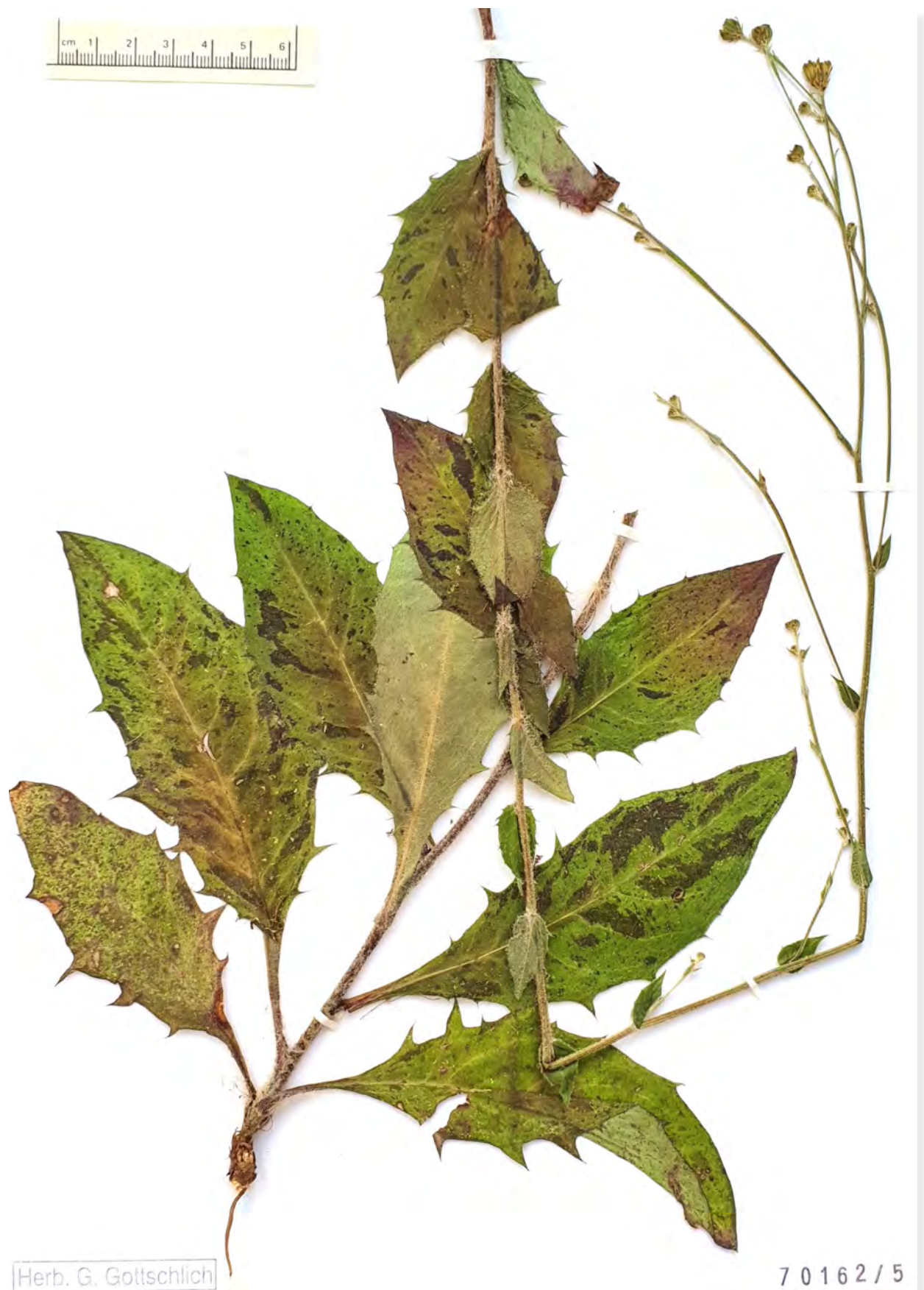
Fig. 9: Hieracium thessalonikense GOTTSCHL. & DUNKEL, specimen.