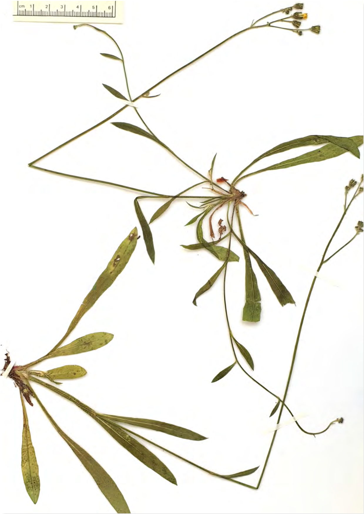
Fig. 11: Pilosella pieriana GOTTSCHL. & DUNKEL, specimen.