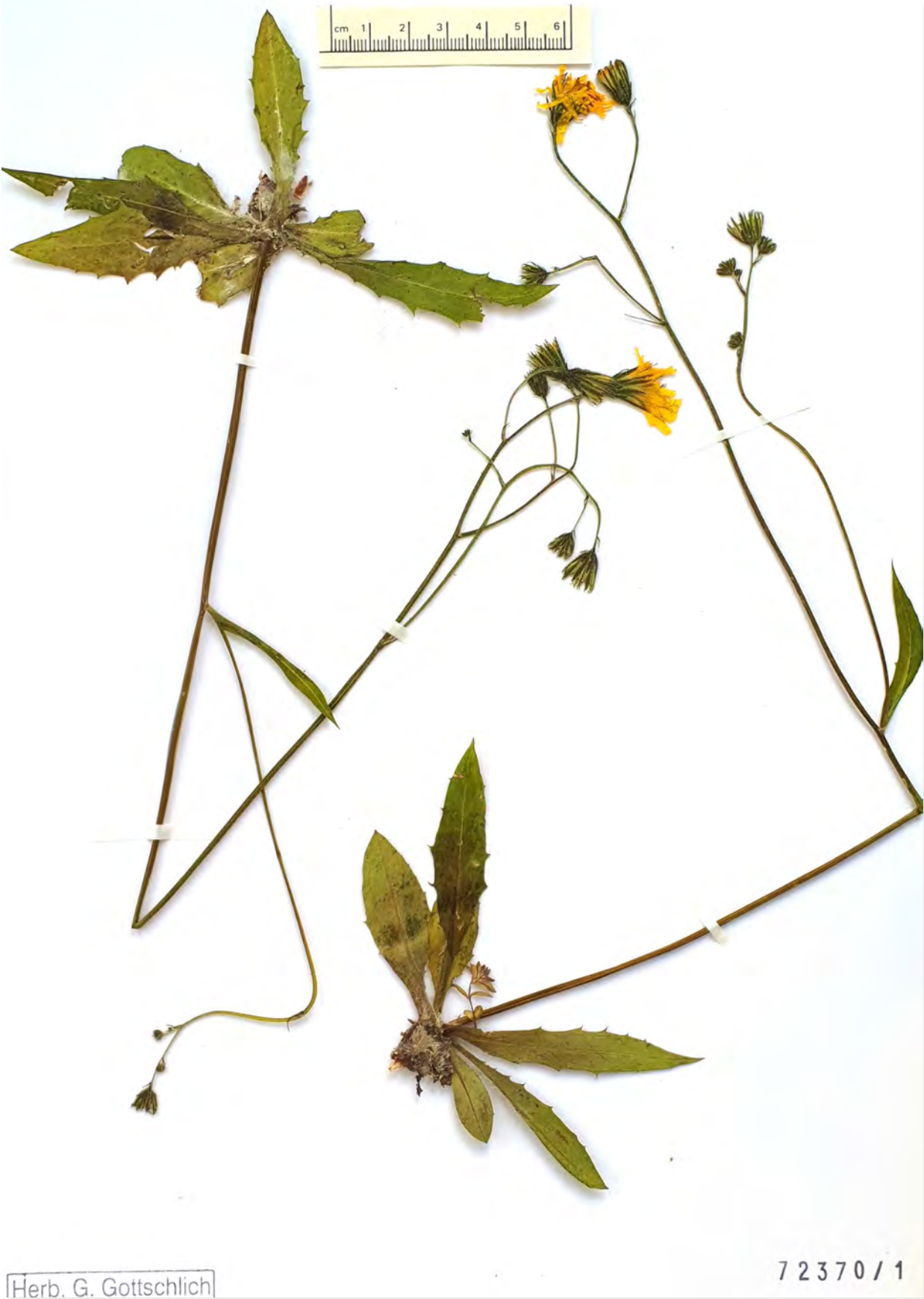
Fig. 7: Hieracium pellense GOTTSCHL. & DUNKEL, specimen.