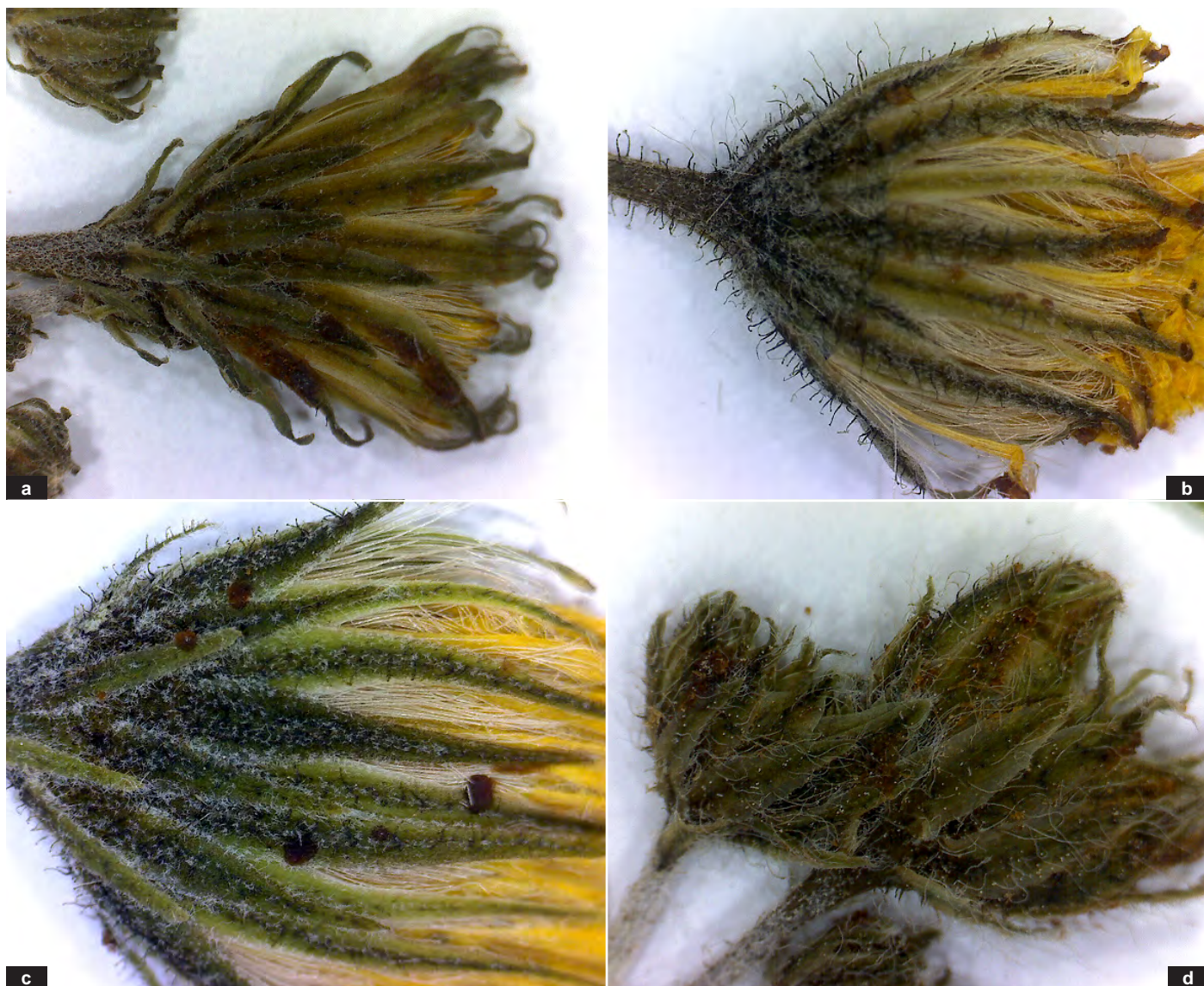
Fig. 20: capitula: a: H. pseudosparsum subsp. elatianum , b: H. retyezatense subsp. macilentoides , c: H. retyezatense subsp. vrontousense , d: H. transiens subsp. excentricum .