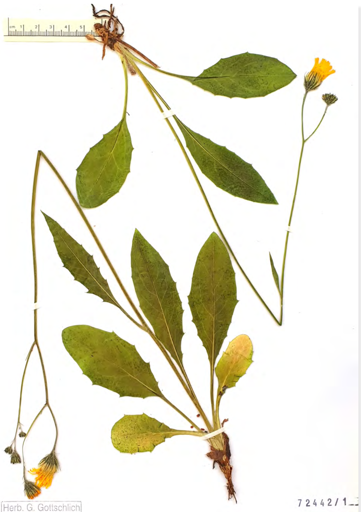
Fig. 16: Hieracium retyezatense subsp. vrontousense GOTTSCHL. & DUNKEL, specimen.