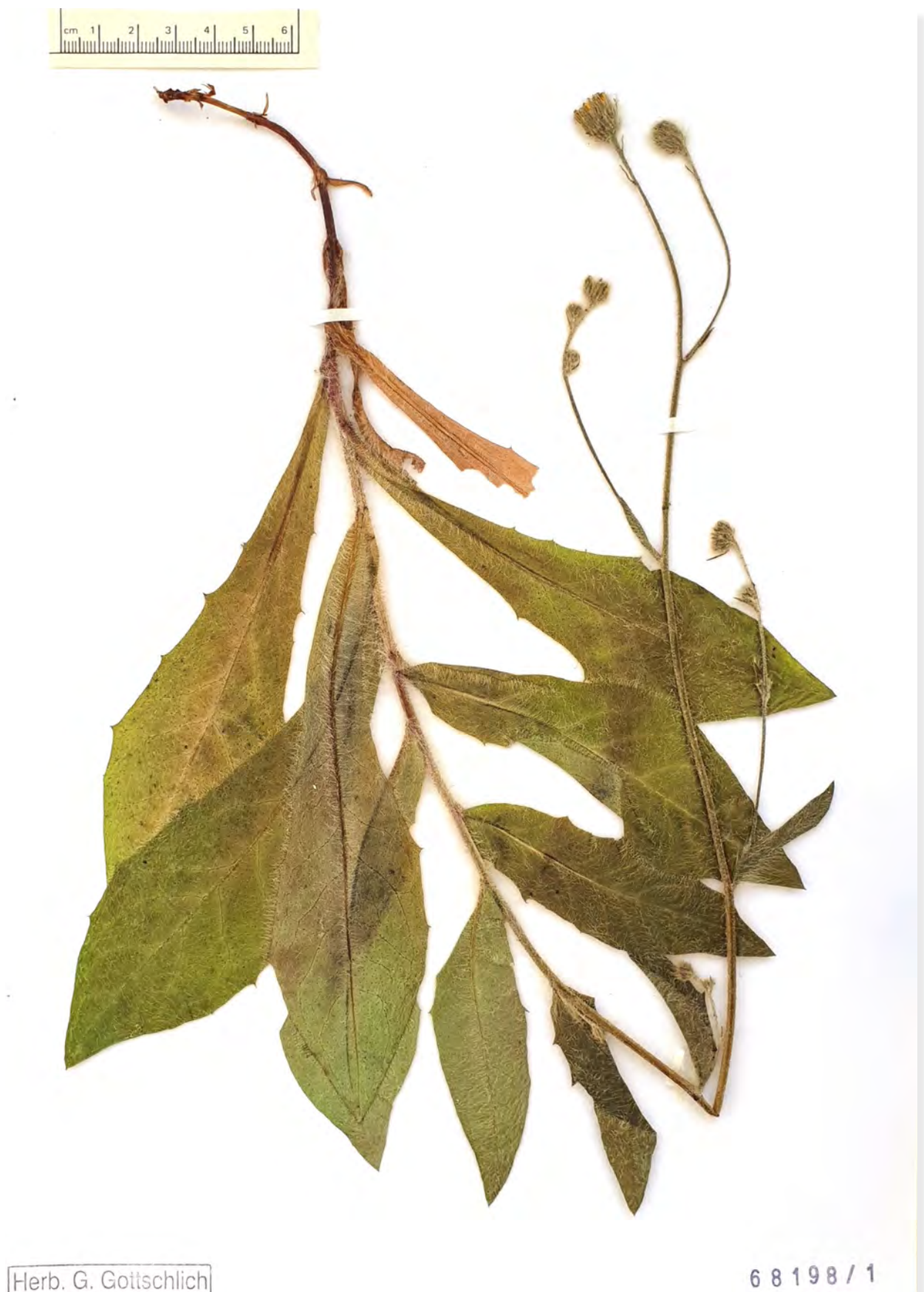
Fig. 6: Hieracium jankolypticum GOTTSCHL. & DUNKEL, specimen.