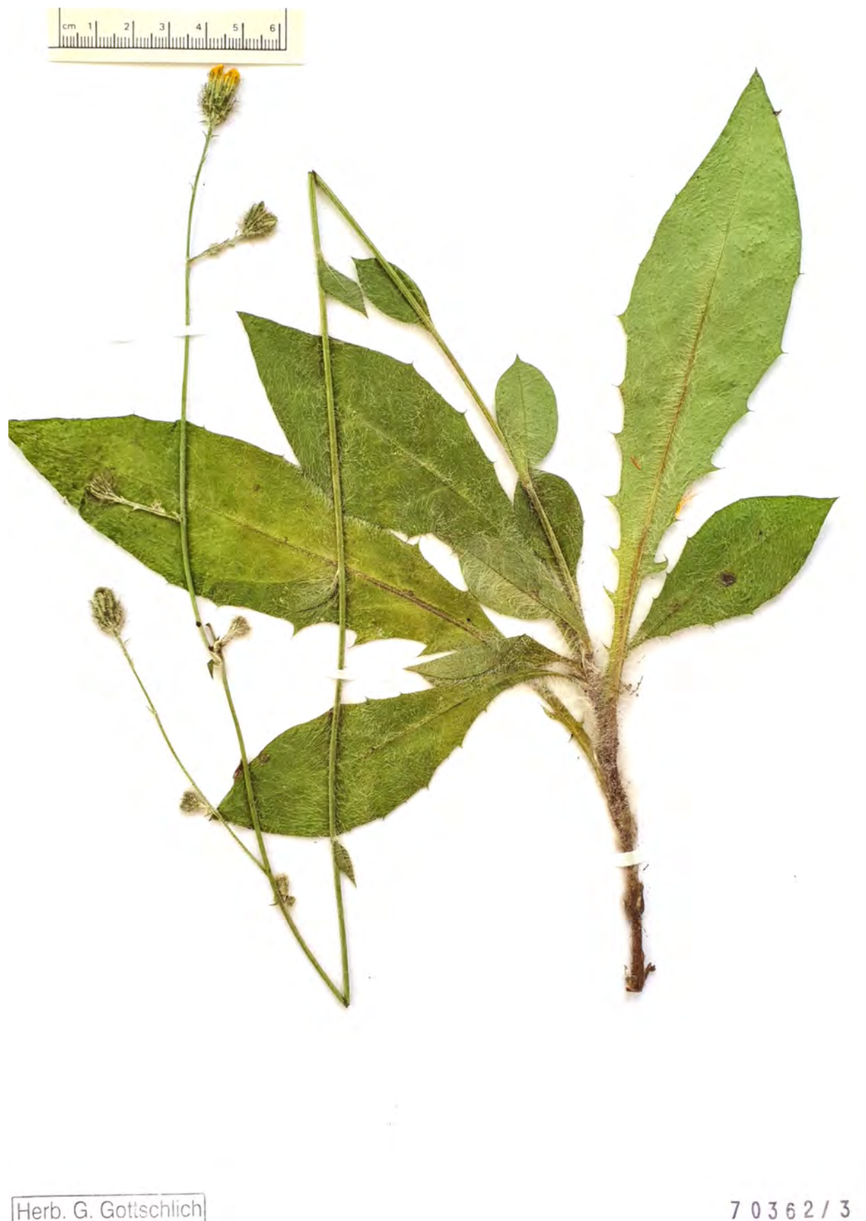
Fig. 4: Hieracium bractolympicum GOTTSCHL. & DUNKEL, specimen.