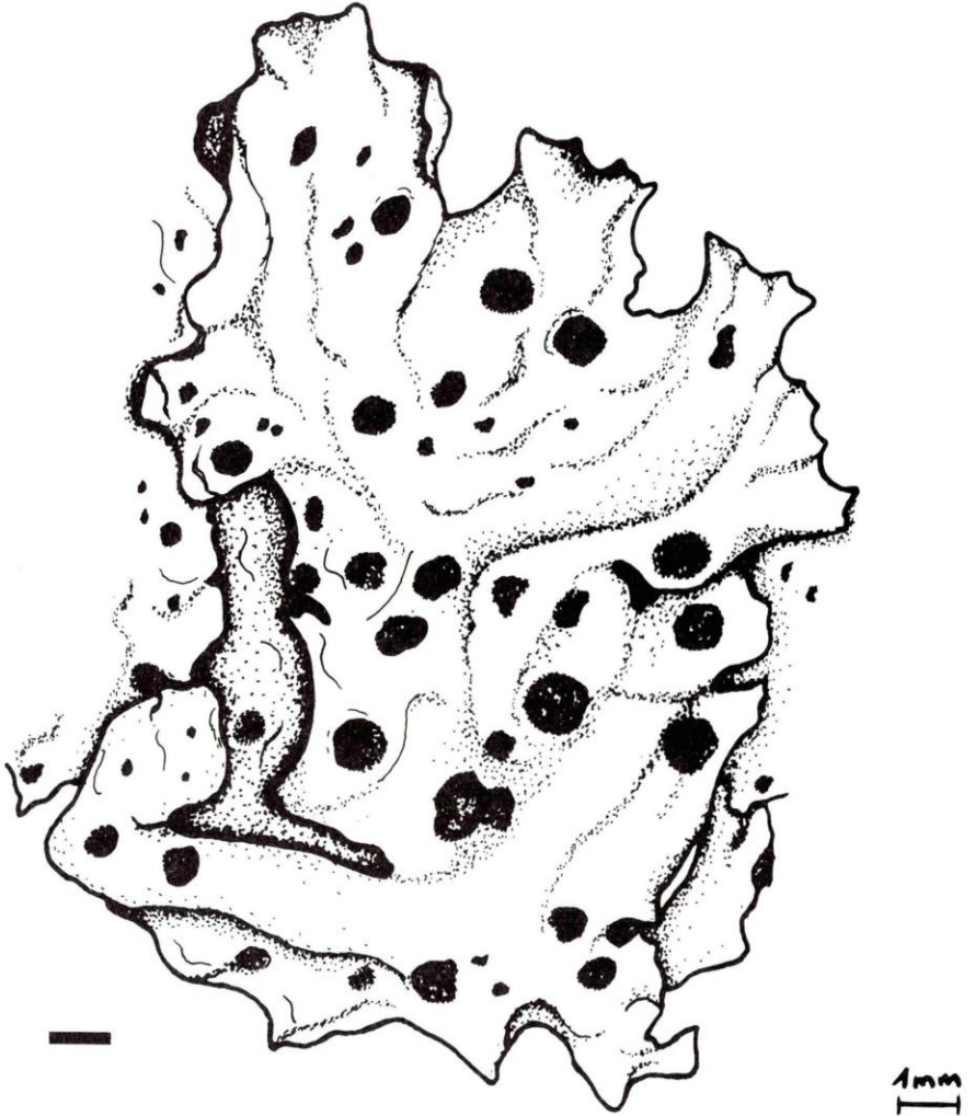
Fig. 2: Apothecia of Plectocarpon nephromeum on Nephroma parile . (Herb. SCHOLZ, CDN-62; scale 1 mm, drawing by A. GUTJAHR, Jena)