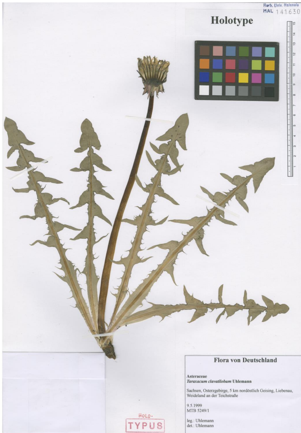
Fig. 1: Taraxacum clavatilobum sp. nov. – Holotype (HAL 141630).

stramineum, 3.0–3.2 mm longum (pyramide exclusa), superne spinulosum, spinulis rectis, pyramis 0.5 mm longa, conica, laevis, rostrum 12–13 mm longum, pappus albus.