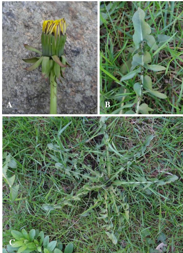
Fig. 2: Taraxacum clavatilobum (Liebenau): A – Flower head and position of the outer bracts; B – Leaf shape; C – habit.