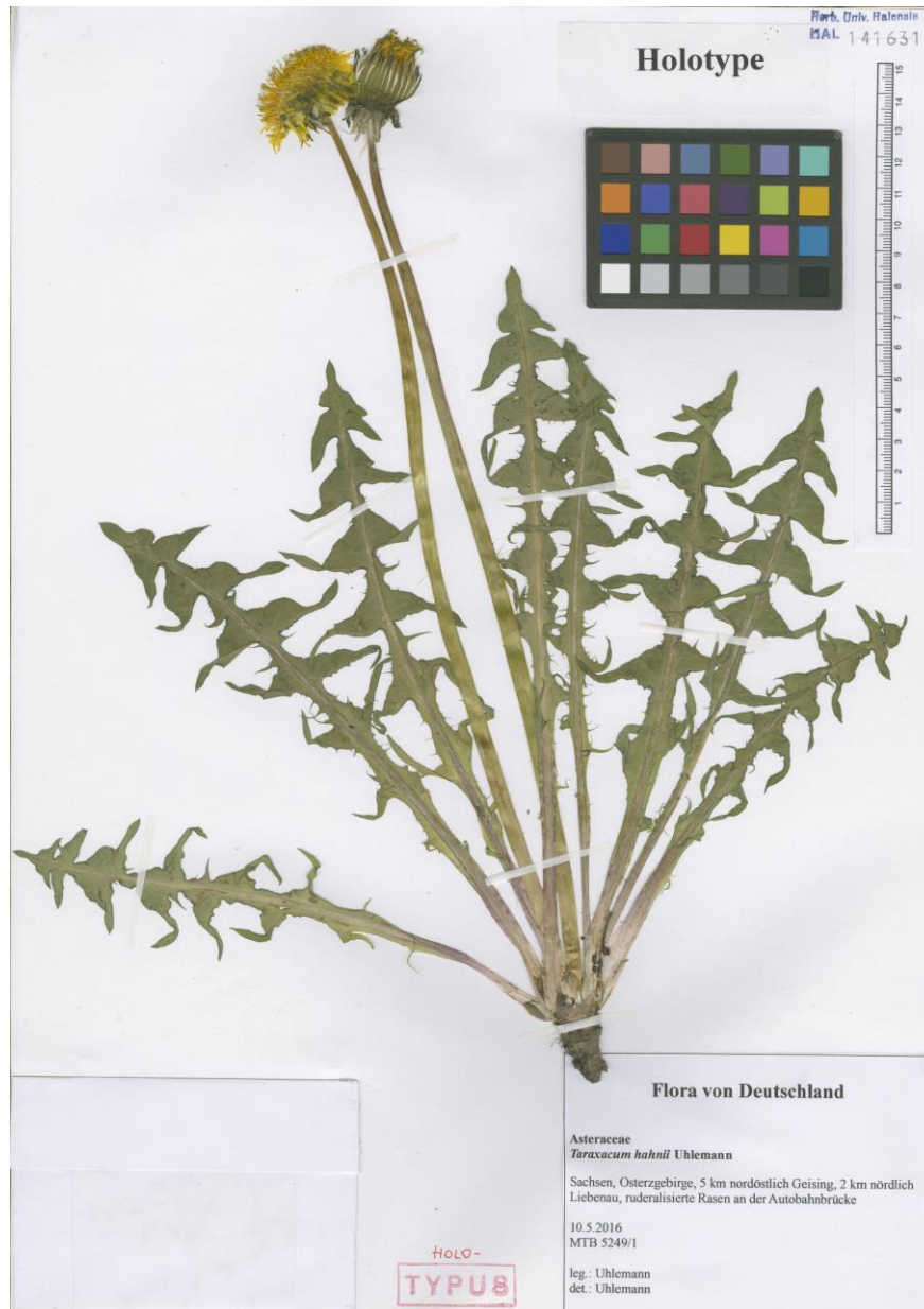
Fig. 4: Taraxacum hahnii sp. nov. – holotype (HAL 141631).

viridibus, solus marginibus lateralibus interdum piceo-coloratis. Scapi superne valde, ceterum sparse araneosi, brunneo-virides. Involucrum olivaceo-viride, leviter pruinose, 18–22 squamis exterioribus, regularibus, recurvis vel reflexis, lanceolatis, (2–)3–4 mm latis, (14–)15–17 mm longis, immarginatis, supra laete cano-viridibus. Calathium 45–50 mm in diametro, luteum radians, ligulis marginalibus planis, subtus stria canoviolacea notatis. Antherae polliniferae, pollinis granis diametro variabilibus, stylus superne laete virescens. Achenium fusco-stramineum, 3.1–3.5 mm longum (pyramide exclusa), superne spinulosum, spinulis rectis, pyramis 0.5 mm longa, conica, laevis, rostrum 9–11 mm longum, pappus albus.