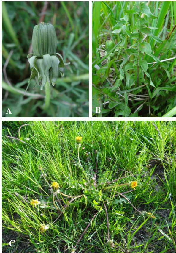
Fig. 6: T. hahnii (Liebenau): A – Flower head and position of the outer bracts; B – Leaf shape; C – habit.