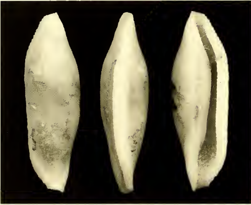
Fig. 2. Prosimnia korkosi , spec. nov., Paratype 1, DFB, coll. No. 7690.