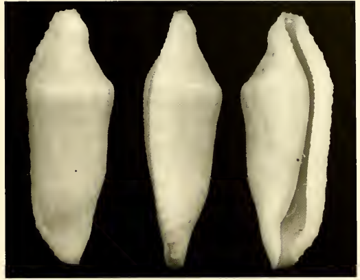
Fig. 4. Prosimnia boshuensis Cate, 1973, DFB, coll. No. 4751. Nada, Wakayama Pref., Japan; dived in 10-30 fathoms.

Prosimnia draconis : The mantle lobes are translucent with numerous bright red and blunt papillae with numerous white tentacles. The yellow shell imitates the yellow stem of the sea fan whereas the papillae are nearly identical in colour and sculpture with the host polyps (Coleman 2003: 93 – last row left picture with yellow shell from Dampier, WA, called here " Prosimnia semperi ").