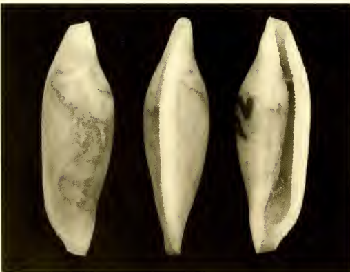
Fig. 3. Prosimnia korkosi , spec. nov., Paratype 2, coll. DKI.

Types. Holotype: Off Coral Beach, Eilat, Israel, Gulf of Aqaba, Northern Red Sea, found alive on small sea fan during night dive at 35-40 meters depth; length: 12.1 mm; width: 3.7 mm; height: 3.2 mm; adult (ZSM coll.). – Paratypes: Nr. 1: same locality as holotype; length: 11.9 mm; width: 3.7 mm; height: 3.0 mm; adult (DFB coll. No. 7690); Nr. 2: same locality as holotype; length: 11.4 mm; width: 3.5 mm; height: 2.9 mm; adult (coll. DKI); Nr. 3: recent; off Eilat, Gulf of Aqaba, Red Sea; taken in gorgonians at 20-30 m, by dive; length: 12.7 mm; width: 3.9 mm; height: 3.4 mm; adult (DFB coll. No. 7421).