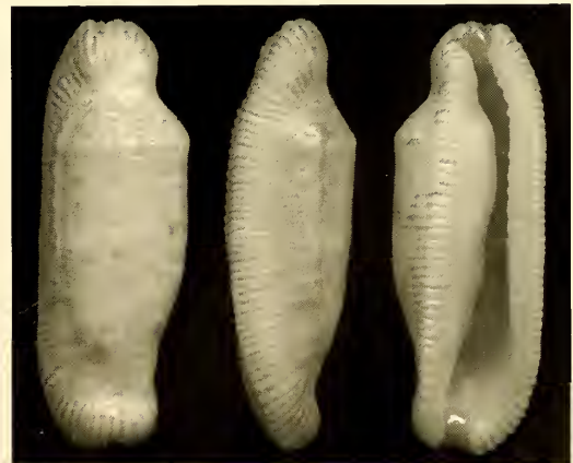
Fig. 6. Prosimnia piriei (Petuch, 1973), DFB, coll. No. 7347. New Hanover Islands, Indonesia; on red gorgonia in strong current at 35-45 m.