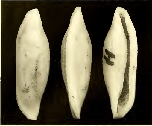
Fig. 1. Prosimnia korkosi , spec. nov., Holotype, ZSM, coll.