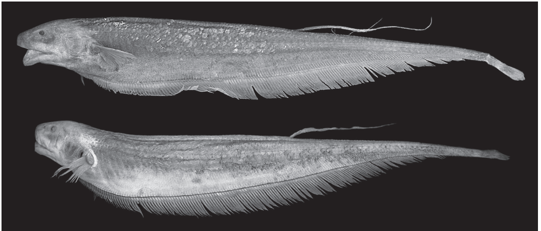
Fig. 1. ZSM 5902 (1) holotype, below ZSM 5901 (1), paratype of Aptereronotus paranaensis .

Tembeassu marauna or Aptereronotus ellisi turn out to be conspecific with Sternarchus paranaensis , then they are junior synonyms and Sternarchus paranaensis would have priority (article 23.1 ICZN). However, in his thesis de Santana (2007) treats this species valid as Aptereronotus paranaensis (Schindler, 1949), probably based on photographs and Schindler's original description he received in June 2004. Tentatively valid as Aptereronotus paranaensis (Schindler, 1949).