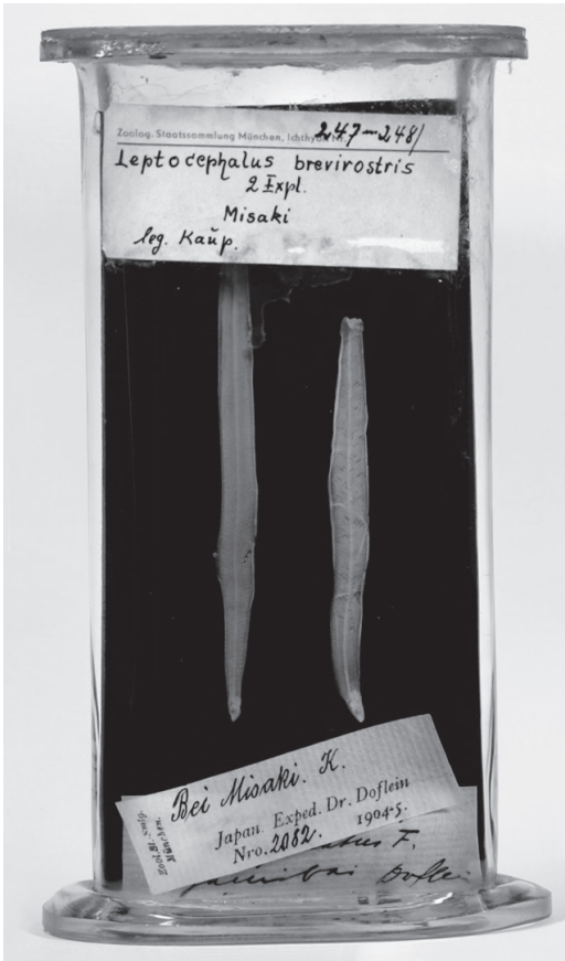
Fig. 3. Rediscovered syntypes of Leptocephalus lacrymatus , ZSM 247–248.

Eschmeyer Catalogue (updated online version, 25 Oct. 2010).