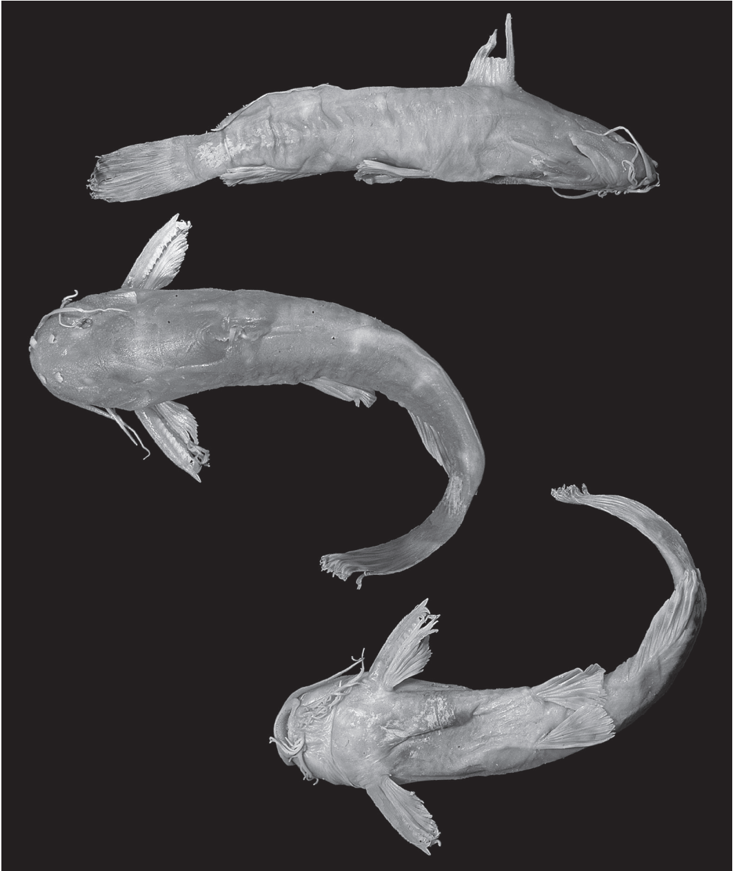
Fig. 5. Questionable syntype of Mochocus brevis , identified as member of the genus Microsynodontis .

Jan. 2011). One plausible explanation would be that the original syntype series accidentally included one Microsynodontis that was subsequently exchanged to ZSM, but the modern distribution of Microsynodontis and Mochocus is non overlapping and the genus Microsynodontis is strictly confined to the Congo basin,