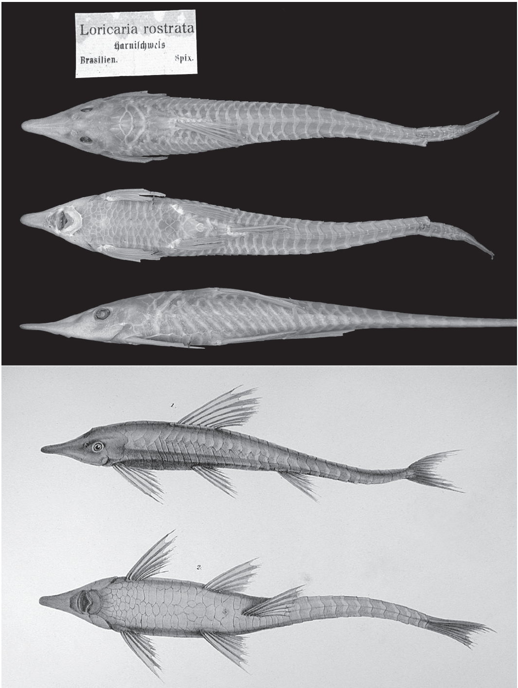
Fig. 4. Rediscovered Spix syntype of Sturisoma rostratus ZSM 30588 (1) in dorsal, ventral and lateral view (excluding tail), below as originally depicted on plate III in Spix & Agassiz (1829).