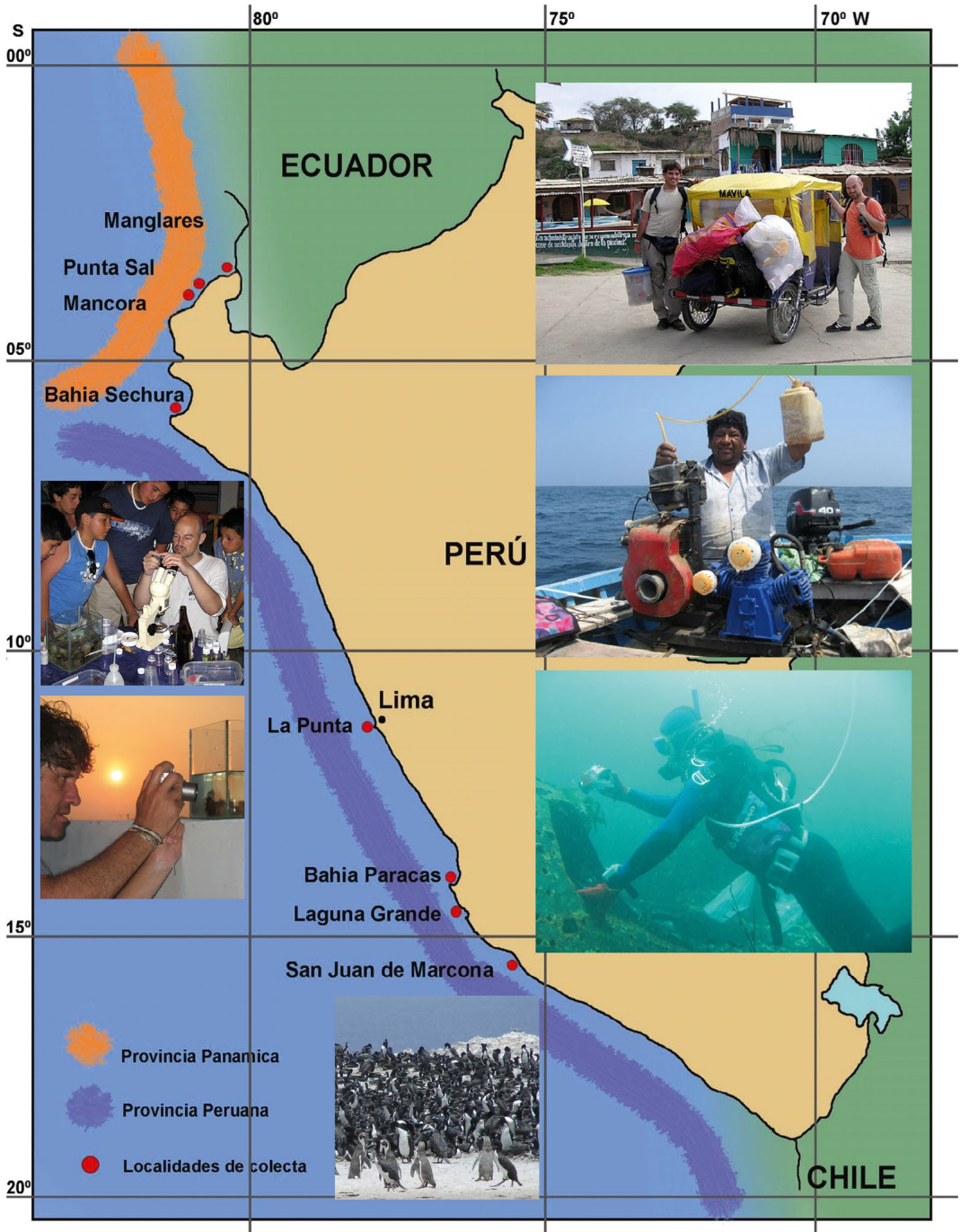
Fig. 1. Map of collecting areas. Large inserts show authors and equipment transported via mototaxi in Mancora, fisherman operating hookah diving compressor, and second author collecting in cold waters off San Juan de Marcona using compressor and garden hose. Small inserts show authors documenting live specimens after collecting, and Humboldt penguins resting at the Atacama desert coast, southern Peru.