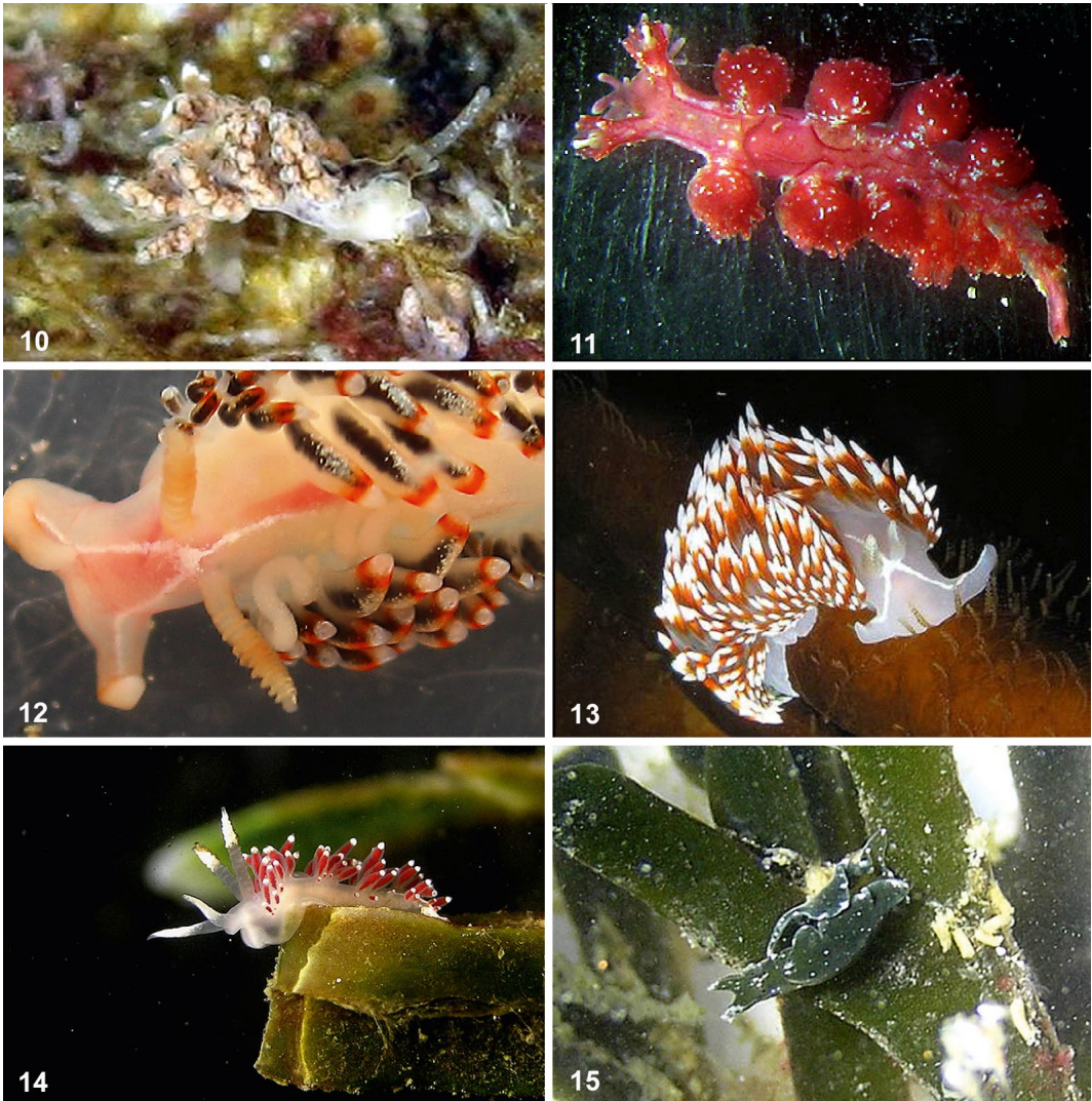
Figs 10–15. Peruvian sea slug species, living specimens. 10. Doto cf. uva (ca 5 mm), Callao. 11. Hancockia schoeferti (ca 1.5 cm), San Juan de Marcona. 12. Phidiana lottini (ca 2 cm), infested with splanchnotrophid endoparasites, 2 pairs of egg-sacs protruding from body; San Juan de Marcona. 13. Phidiana lottini (ca 3 cm), non-infested; Paracas. 14. Flabellina cf. erverai (ca 7 mm), Sechura Bay. 15. Elysia cf. hedgpethi (ca 5 mm), Paracas.

cal and histological detail; these authors suspected that a complex of cryptic species may explain the considerable external and colour variation observed. Our specimens from San Juan de Marcona resemble Chilean specimens by having quite stout cerata, while specimens from Paracas and Callao may