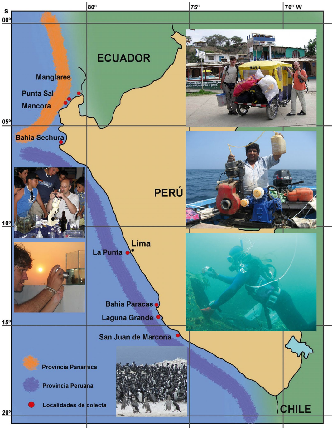
Fig. 1. Map of collecting areas. Large inserts show authors and equipment transported via mototaxi in Mancora, fisherman operating hookah diving compressor, and second author collecting in cold waters off San Juan de Marcona using compressor and garden hose. Small inserts show authors documenting live specimens after collecting, and Humboldt penguins resting at the Atacama desert coast, southern Peru.