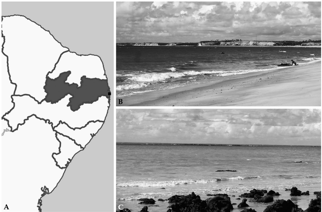
Fig. 1. A. Map of study area (northeastern Brazil: state of Paraíba). B–C. Photos of intertidal zone on Jacarapé Beach (state of Paraíba) showing sandy bottoms and diffuse rocky aggregations.