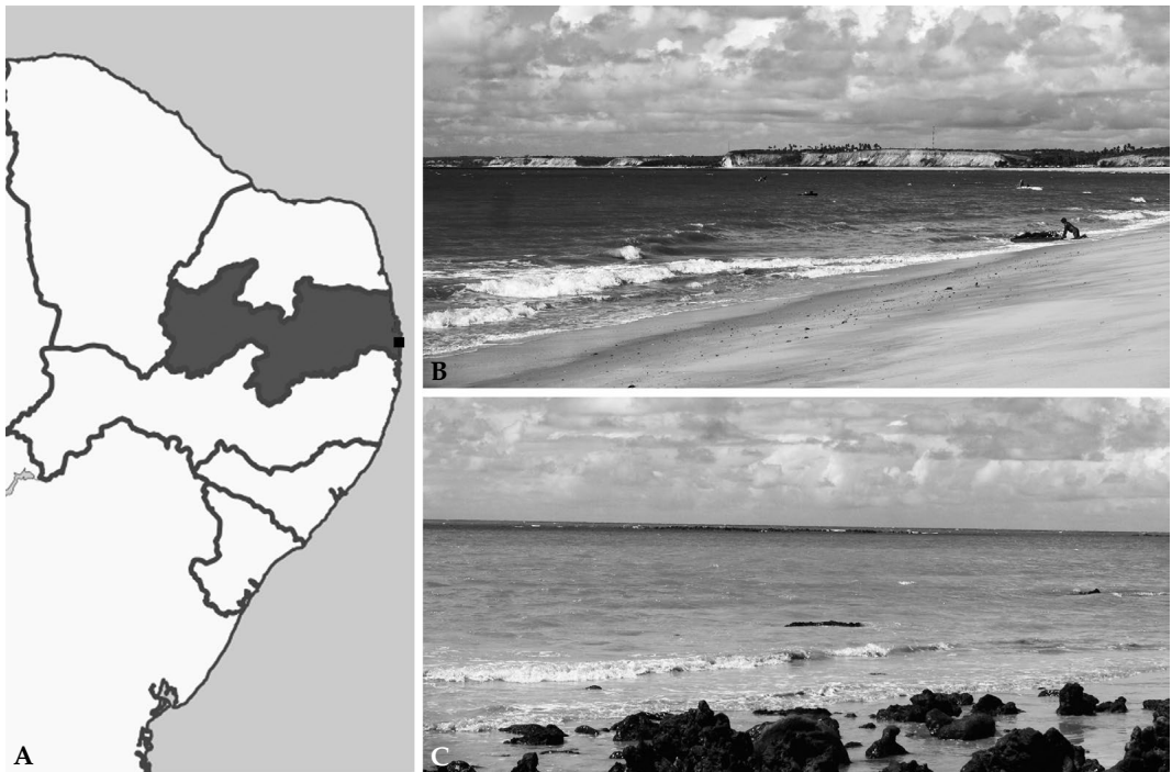
Fig. 1. A. Map of study area (northeastern Brazil: state of Paraíba). B–C. Photos of intertidal zone on Jacarapé Beach (state of Paraíba) showing sandy bottoms and diffuse rocky aggregations.