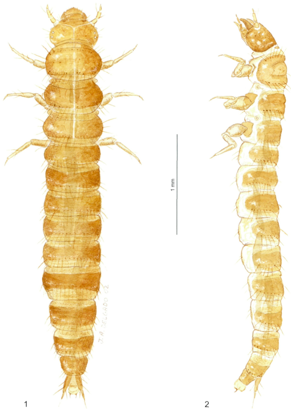
Figs. 1 - 2: Third instar larva of Ochthebius (s.str.) gonggashanensis , habitus: 1) dorsal view, 2) lateral view.