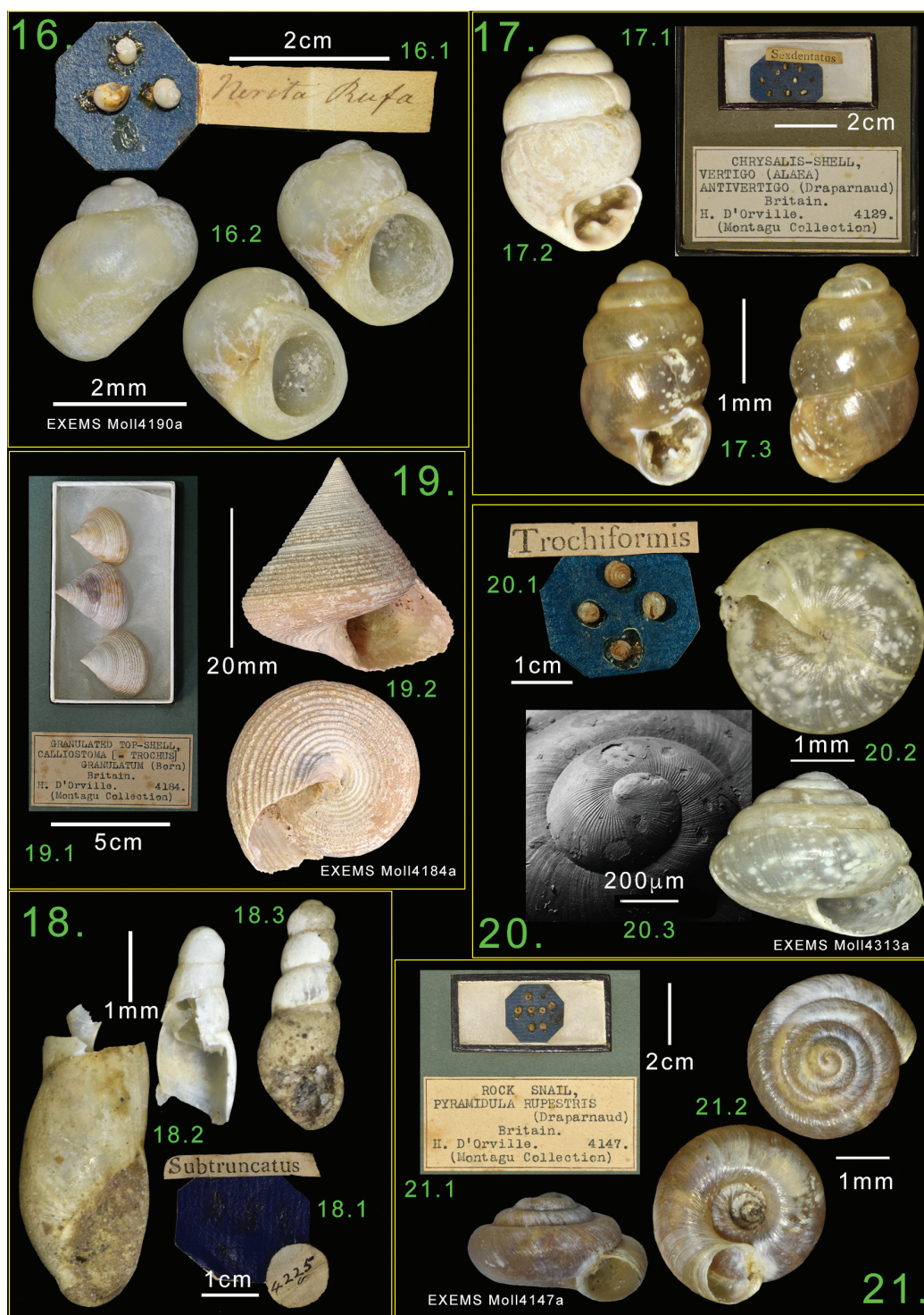
Figures 16–21. 16. Nerita rufa Montagu, 1803 [ Euspira sp. juveniles]. 16.1 Montagu hexagonal blue card mount and hand written label with 3 shells all EXEMS Moll4190. 16.2 Abapertural, apertural and basal views of a single shell, EXEMS Moll4190a. 17. Turbo sexdentatus Montagu, 1803 [ Vertigo antivertigo (Draparnaud, 1801)]. 17.1 “Rowley” box with blue card mount and 8 shells, EXEMS Moll4129. 17.2 Apertural view of a worn shell. 17.3 Apertural and abapertural views of a fresh shell. All are Vertigo pygmaea (Draparnaud, 1801). 18. Turbo subtruncatus Montagu, 1803 [ Truncatella subcylindrica (Linnaeus, 1767)]. 18.1 Montagu blue hexagonal card mount with printed label. 18.2 Larger, but broken, syntype EXEMS Moll4255b. 18.3 Smaller syntype, mostly apex EXEMS Moll5255b. 19. Trochus tenuis Montagu, 1803 [ Calliostoma granulatum (Born, 1778)]. 19.1 “Rowley” box with 3 shells, syntypes, EXEMS Moll4184. 19.2 Apertural and basal views of a single syntype, EXEMS Moll4184a. 20. Helix trochiformis Montagu, 1803 [ Euconulus fulvus (Müller, 1774)]. 20.1 Montagu blue hexagonal card and printed label with 4 shells, all syntypes, EXEMS Moll4313. 20.2 Basal and apertural views of a single syntype, EXEMS Moll4313a. 20.3 Scanning electron micrograph of the apex. 21. Helix umbilicata Montagu, 1803 [ Pyramidula umbilicata (Montagu, 1803)]. 21.1 “Rowley” box with card mount and 7 shells, all syntypes EXEMS Moll4147. 21.2 apertural, dasal and apical views of a single syntype, EXEMS Moll4147a.