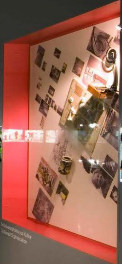
Schreibweise des Kultur Erbes