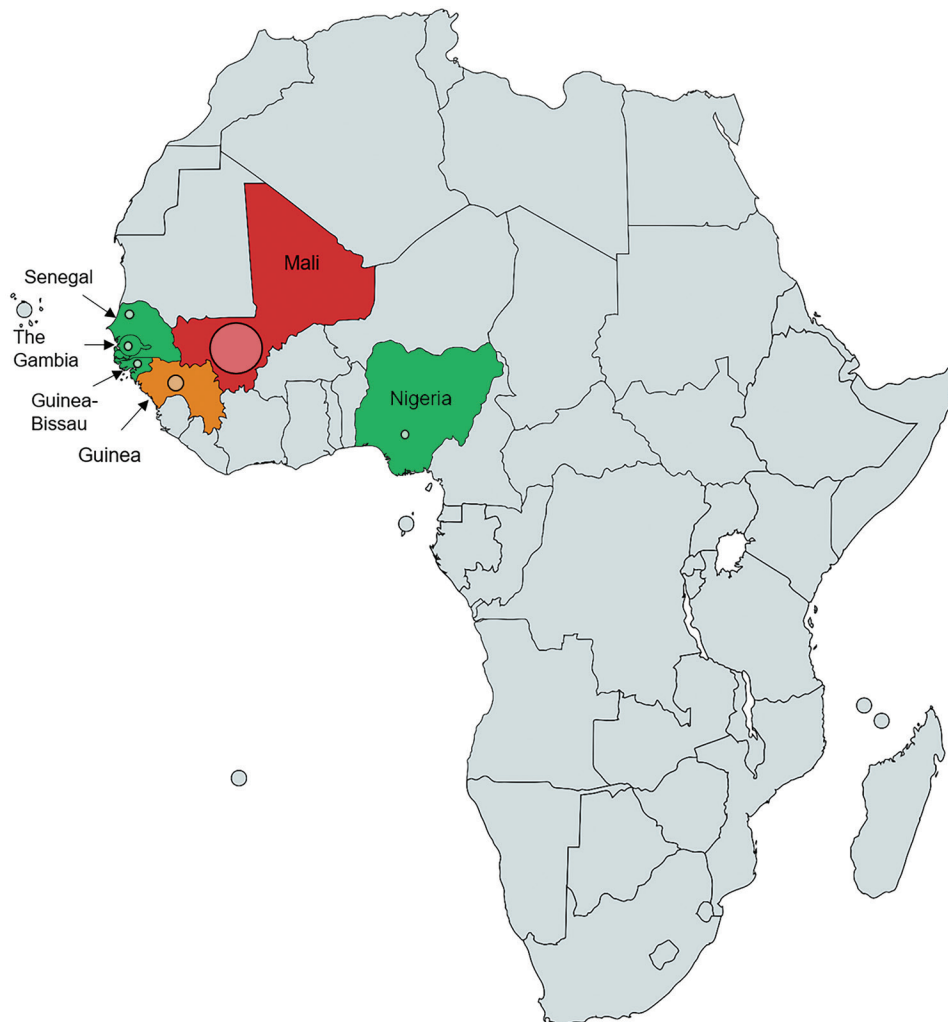
Figure 3. Geographic distribution of 13 patients infected by Nannizziopsis obscura in West Africa. The different colors represent the number of cases in each country: red for 7 cases, orange for 2 cases, and green for only 1 reported case. The diameter of the circle indicated for each country is proportional to the number of cases reported.

The issue of the portal of entry remains unclear. Subcutaneous nodules, ulcerative skin lesions, or both are frequently noted (e.g., in patients 2, 3, 4, 5,