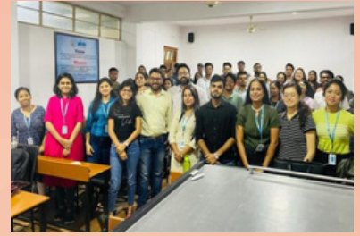
Interactive Session for HRM II students with senior alumni.

To read more, click on the link: https://www.xiss.ac.in/news/hrm-programme-organises-interactive-session-with-senior-alumni