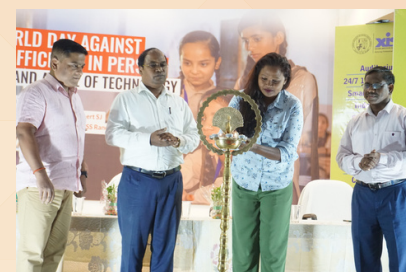
State-level Round-Table discussion on World Day Against Trafficking in Person organized at XISS.

To read more, click on the link: https://xiss.ac.in/readmore/state-level-round-table-discussion-on-world-day-against-trafficking-in-person-organized-at-xiss