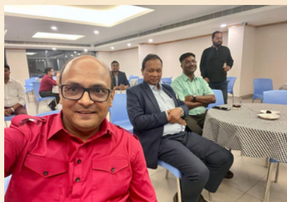
Memories re-lived during XAAB Bangalore Alumni meet.