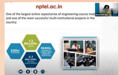
e-Workshop organised on SWAYAM NPTEL Awareness for XISS students.