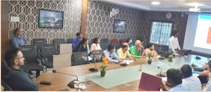
Sampark-Lohardaga DPC presenting the vaccination data in DLTF meeting.

'COVID vaccination Amrit Mahotsava' began from 15 July 2022 to provide free precautionary dose to all adult eligible population. It is a part of the celebration for 'Azadi ka Amrit Mahotsav'. Likewise in Jharkhand, the campaign began in full swing. It saw a spike in the number of people taking precaution doses. The XISS-UNICEF supported district coordinators in 14 districts of the state are facilitating the preparation of strategic and focused micro plans and session sites. They are actively involved in the day-to-day monitoring of the vaccination data, presenting the analysis in district-level task force meetings led by District Collectors (DCs). They are also coordinating with Non-Governmental Organizations (NGOs) in awareness generation in the hard-to-reach pockets and tribal belts.