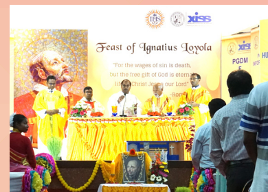
Feast of St Ignatius of Loyola celebrated at XISS.