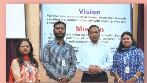
XISS Bulletin Team