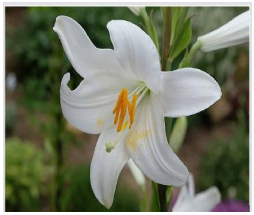
Figure 2- Flower of Lilium candidum L. [6]