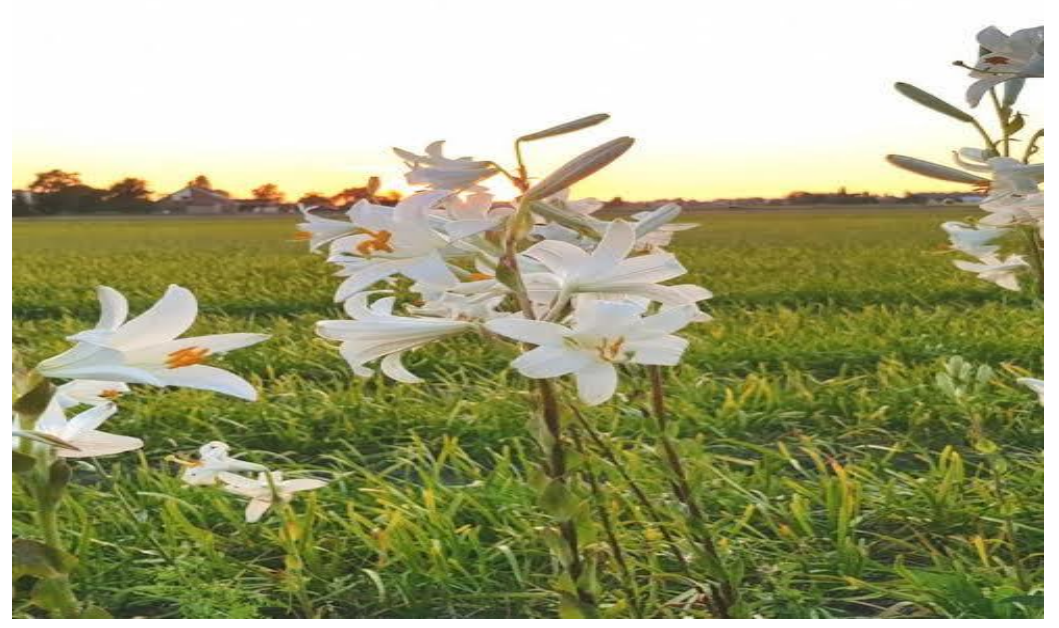
Figure 1- Plant of Lilium candidum L . [5]

The species Lilium candidum L is also called white lily, or white Madonna lily, which is well established for its traditional medicines which were widely used for the treatments of inflammations, burns, healing wounds and for ulcers in the extract of Lilium candidum L . On the basis of the hypothesis of the extract of the Lilium candidum possess the bio-protective activity due to correlations of anti-mutagenic activity of natural compounds with antioxidant effects and contents of phytochemical constituents from the flavonoids groups.[4]