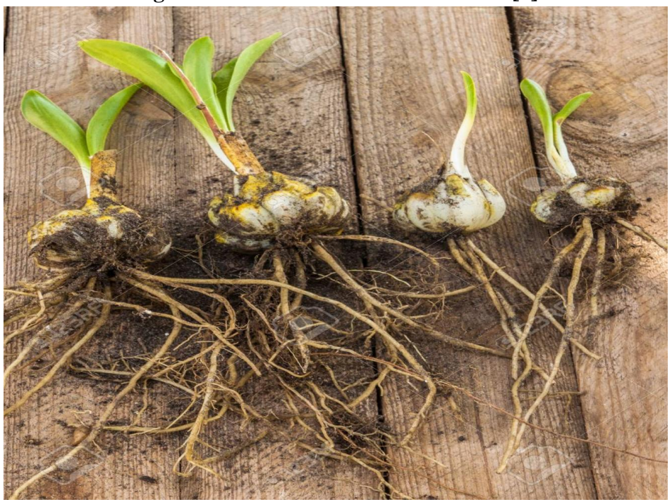
Figure 3- Leaves, Bulbs and Roots of Lilium candidum L.[7]