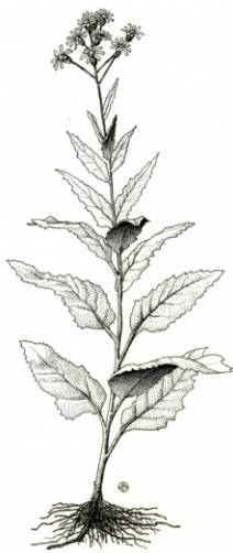
Illustration L. Mennell - YG