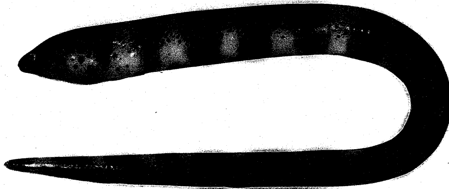
Fig. 2. Gymnothorax reticularis , 380 mm TL.